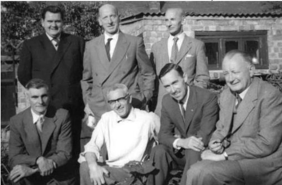
Taken at the 1960 AGM.